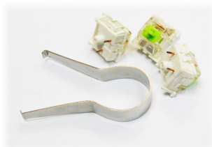
Easy to change key switch by puller